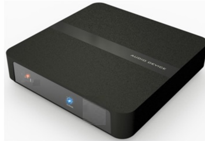
RF26d, Receiver w/Amp